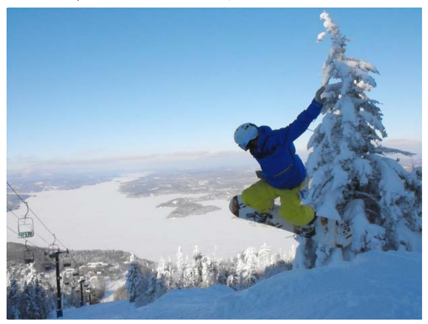
A thrilling ride at Owl's Head overlooking Lake Memphremagog.

BY ROCHELLE LASH, SPECIAL TO THE GAZETTE NOVEMBER 8, 2012